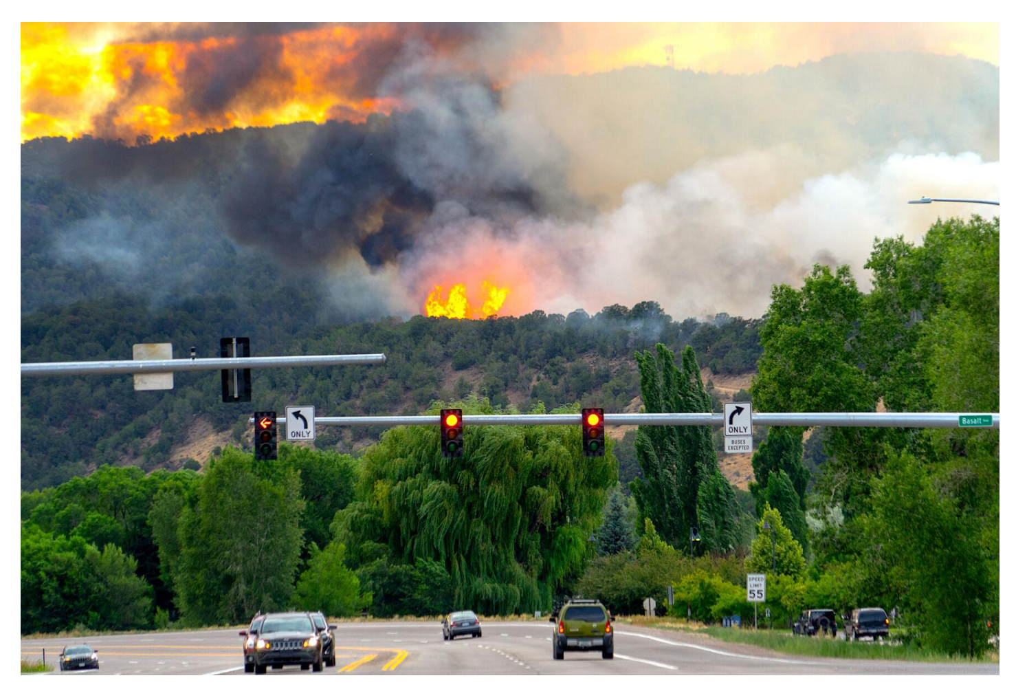
Smoke rises from the hillside around Basalt on July 3, 2018, after the start of the Lake Christine Fire.

Wildfires don't discriminate. Whether they're tearing through California's chamise chaparral and eucalyptus trees or the Roaring Fork Valley's towering conifer forests, aspen trees and oak brush, the destructive power is universal. The devastation is not just measured in acres burned but in lives upended, homes lost and ecosystems irreparably damaged. And as we've seen, climate change is exacerbating these risks, extending fire seasons and making each blaze more unpredictable and ferocious.