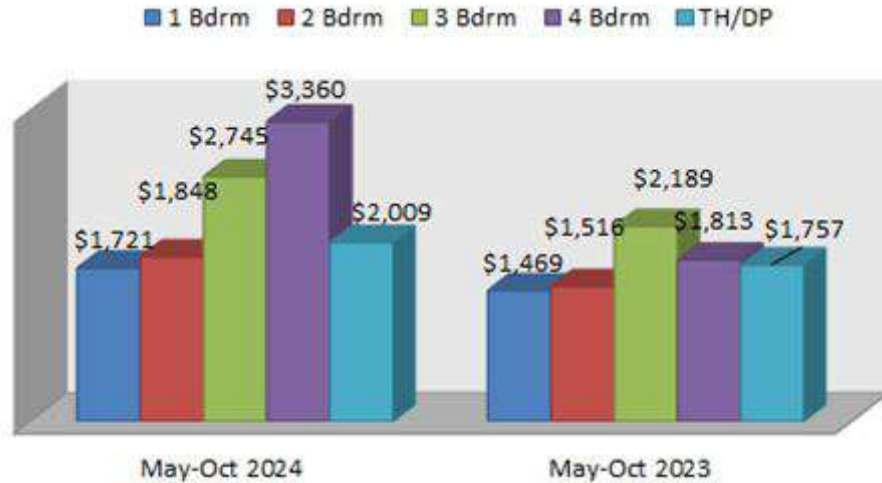
Avg Sold $ / Sq Ft