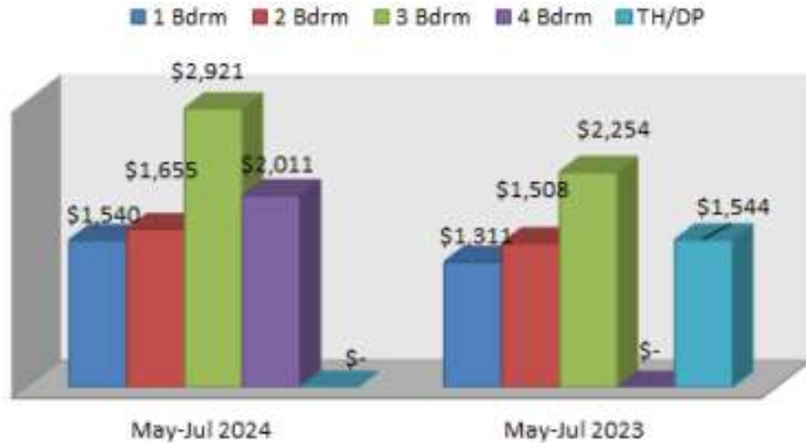
Avg Sold $ / Sq Ft