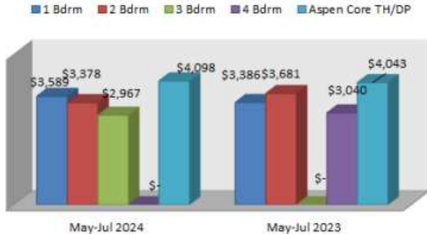
Avg Sold $ / Sq Ft